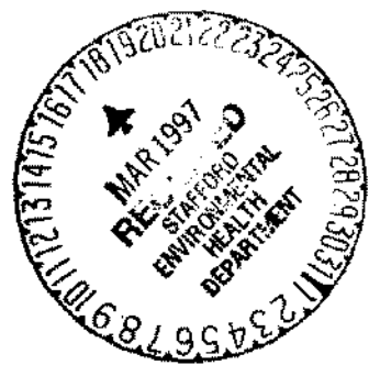
DIAGRAM (NOT TO SCALE)

set 4" P.V.C. Well Casing & screen due to the softness of the formation